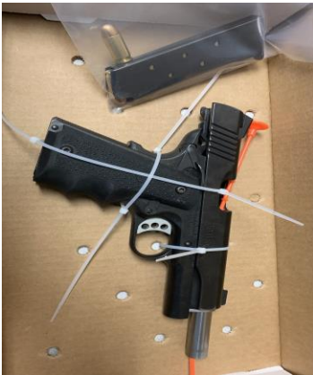
Remington 1911 .45 caliber handgun

Charges: *Five counts of Criminal Possession of a Controlled Substance in the Third Degree, class B Felonies, *Two counts of Criminal Possession of a Controlled Substance in the Fourth Degree, class C Felonies, Criminal Possession of a Controlled Substance in the Fifth Degree, a class D Felony, *Four counts of Criminal Possession of a Weapon in the Second Degree, class C Felonies, *Three counts of Criminal Possession of a Weapon in the Third Degree, class D Felonies, *Two counts of Criminal Possession of a Weapon in the Fourth Degree, class A Misdemeanors and *Two counts of Criminally Using Drug Paraphernalia in the Second Degree, class A Misdemeanors.