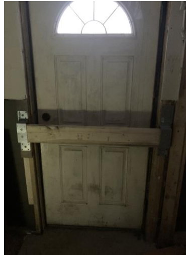
Inside of residence doors barricaded

The Broome County Special Investigations Unit Task Force is comprised of members of the Broome County Sheriff's Office, the City of Binghamton Police Department, the Village of Johnson City Police Department and Village of Endicott Police Department.