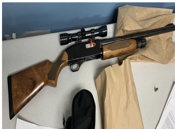
Winchester model 300, 12 gauge shotgun