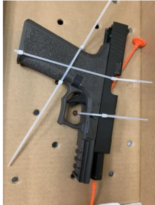
Polymer 80 Inc. 9mm handgun