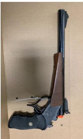
Thompson Center .44 magnum handgun