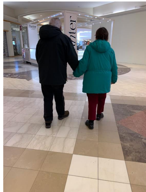
A couple participates in the Walk with Ease program at the Oakdale Commons mall in Johnson City

Social Isolation and Intergenerational Support – Social Isolation continued to be a top priority for OFA in 2023. Binghamton University interns made 225 home visits to 45 older adults in their homes to engage in conversations and various activities. Older adults reported enjoying their regular home visits and students served as “eyes in the home” for OFA staff. In many cases students were able to report challenges experienced by clients back to their caseworkers who then addressed the issues as needed. Two intergenerational dance events were held in 2023. The Senior Sock Hop was supported by Vestal Senior High School students and Town of Vestal as part of the town’s 200 th anniversary celebration. 100 older adults enjoyed an evening of music and dancing. The second event was held at the Johnson City Senior Center in collaboration with Johnson City High School students and other agencies. This event was attended by 86 older adults and supported by a dozen students. To encourage healthy activities in the community, an evidence-based program, Walk with Ease continued to be offered at the local mall and was supported by OFA staff and two interns. Technology played a crucial role in helping older adults combat social isolation. Technology in the form of robotic pets, tablets/iPads and personal ElliQ robots were placed in homes in 2023. Older adults who received tablets/iPads were encouraged to access virtual senior center activities via online platforms.