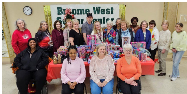
Foster Grandparent Program Volunteers