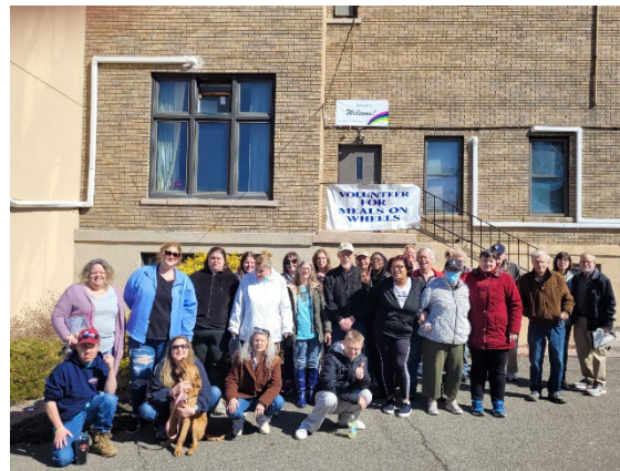
Meals on Wheels volunteers at the new office location