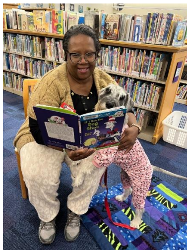
Foster Grandparent Volunteer at the Broome County Library

In Home Services Program (IHSU) - The Guaranteed Aide Program was renewed by OFA which provides 30 hours of aide service directly to clients being served by OFA’s In-Home Services Unit. It was important to continue to support the Guaranteed Aide initiative since there continues to be a shortage of aides throughout the county and state. The Guaranteed Aide model allows OFA to provide a higher rate of pay, mileage reimbursement and time off to the aide assigned to OFA cases. This initiative was supported by unmet needs funding issued by the New York State Office for Aging. With this new initiative, OFA reduced the waitlist for some clients needing service. The Guaranteed Aide also promoted service in rural underserved communities.