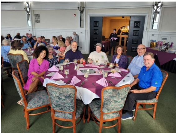
OFA Volunteers Recognition Dinner