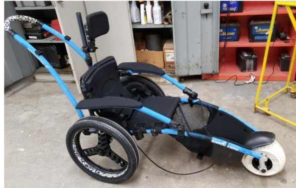
All-terrain beach chair is available at Dorchester park

In 2023, a new survey was distributed to learn about the 55+ population and their needs. A new three-year Action Plan covering the 2024 - 2027 is being reviewed and will be submitted to AARP in 2024. We look forward to collaborating with local partners on making continuous age-friendly improvements in Broome County that help people of all ages.