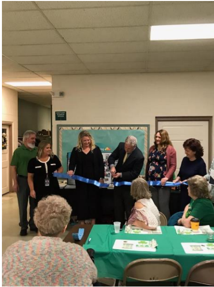
Ribbon cutting at the new Chenango Bridge Senior Center