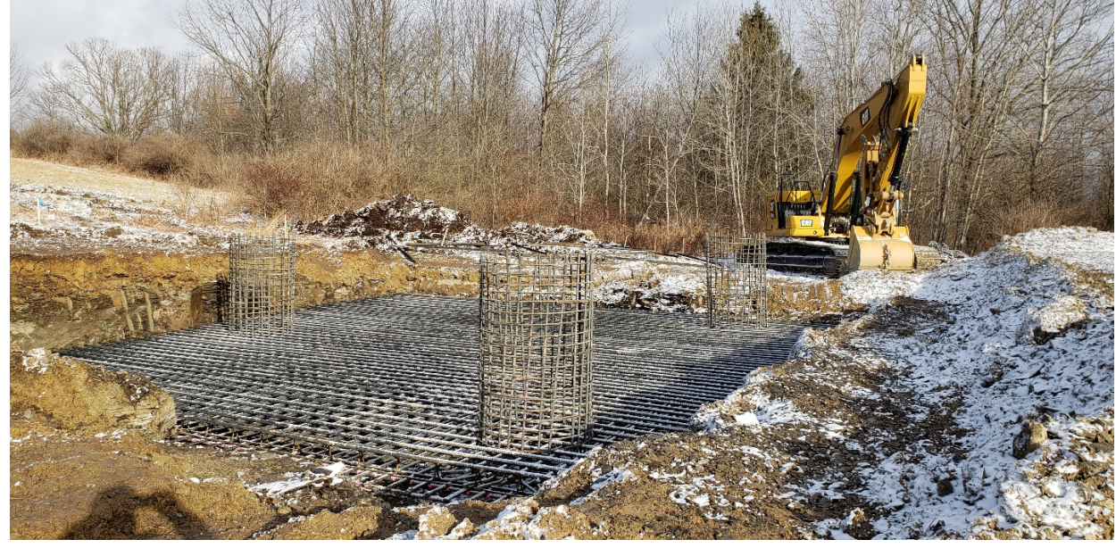
Nabinger Hill – Rebar for tower foundation.