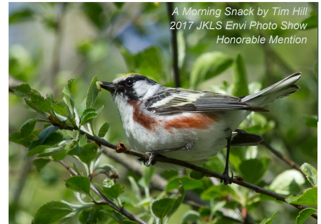
A Morning Snack by Tim Hill 2017 JKLS Envi Photo Show Honorable Mention

You can also be added to the EMC listserv by emailing us at: emcbroomecounty@gmail.com